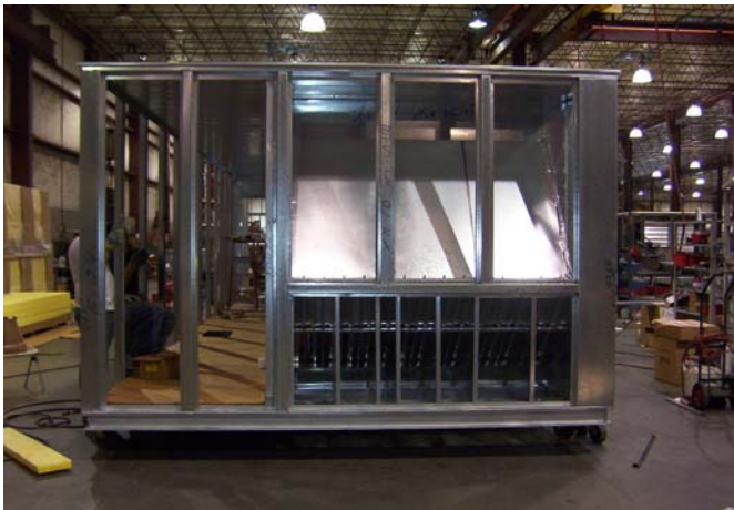
Replacement double deck multi-zone with service corridor.

Condensing section EER 13.1 and total unit EER 10.3.