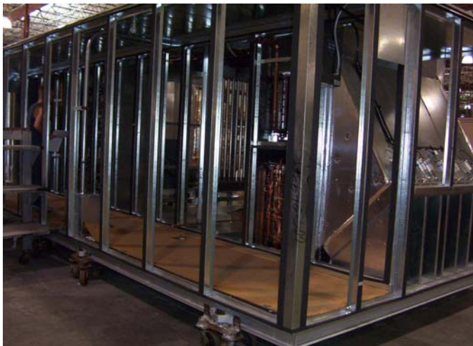
Steam humidifier, 30% pleated and 85% bag filters