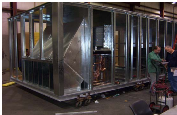
Pre-heat hot water coil with face and bypass dampers and a hot water coil in the hot deck.