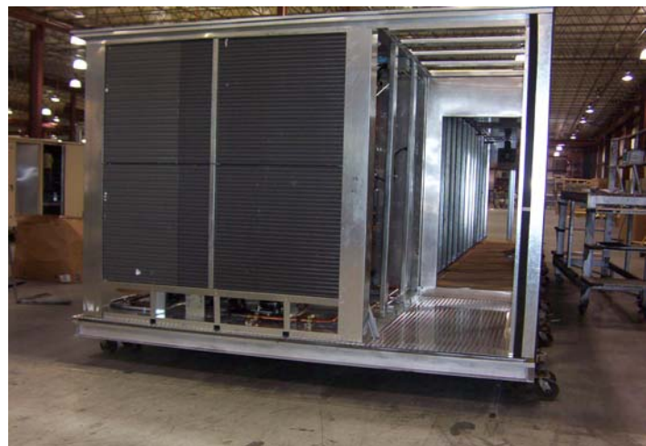
Oversized condenser surface with energy efficient condenser fan motors