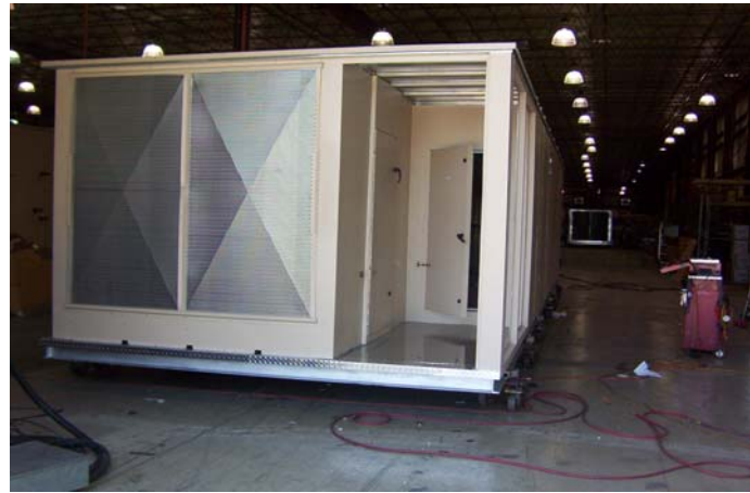
Painted aluminum exterior panels and expanded aluminum condenser coil guards.