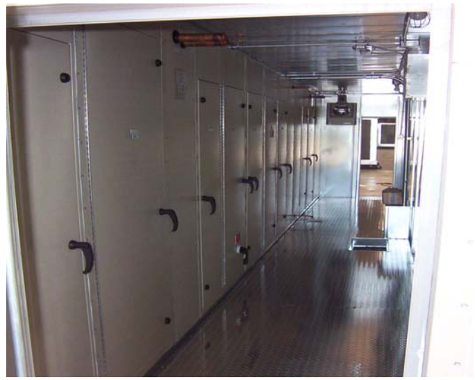
Service corridor with hinged access doors, single door handle with multiple latches, aluminum tread plate floor, exhaust fan and electric heater.