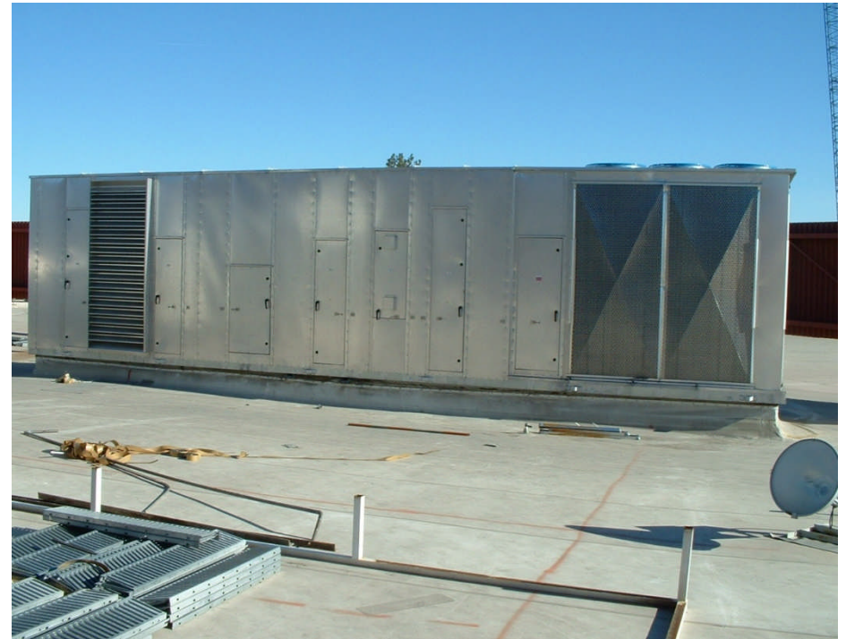
Seasons-4 Direct Replacement