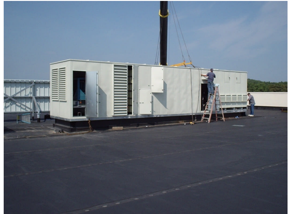
Seasons-4 Direct Replacement