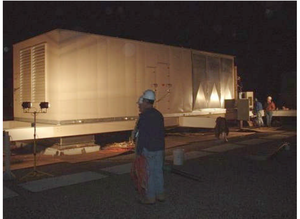
Seasons-4 Direct Replacement