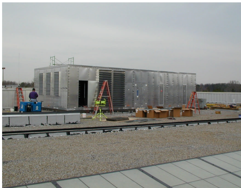
Seasons-4 Direct Replacement

4500 Industrial Access Road Douglasville, GA ; P 770-489-0716 www.seasons4.net