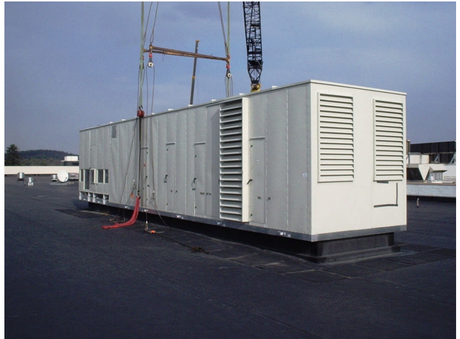
Seasons-4 Direct Replacement