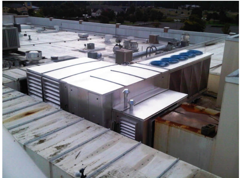
Seasons-4 Direct Replacement

4500 Industrial Access Road Douglasville, GA ; P 770-489-0716 www.seasons4.net