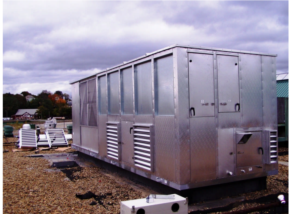
Seasons-4 Direct Replacement