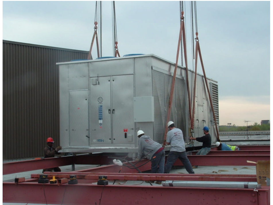
Seasons-4 Direct Replacement

4500 Industrial Access Road Douglasville, GA ; P 770-489-0716 www.seasons4.net